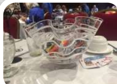
Table centerpieces - Corning Bowl

That evening we had a wonderful closing banquet of turkey, stuffing, potatoes and green beans with chocolate cake for dessert. Every driver received a beautiful glass plaque with our car number on a wooden stand made by Bob Giles.