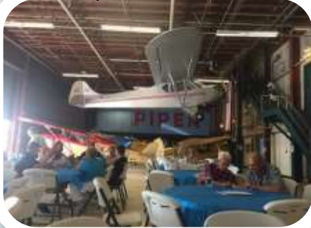
Piper Aircraft Museum

the Piper Aircraft Museum. The Piper Aircraft Museum was also our lunch stop. After touring the 2 floors of Piper aviation history, we had a great lunch catered