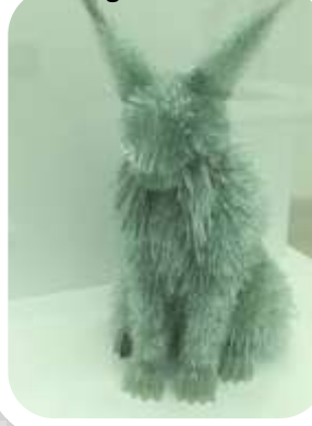
Corning Glass Museum

The Corning Museum was amazing. Their exhibits were beautiful as well as educational. We were able to see the