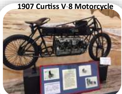
1907 Curtiss V-8 Motorcycle

we had dinner on our own. We were asked to join the town for a watermelon social and car show in the Wellsboro Park.