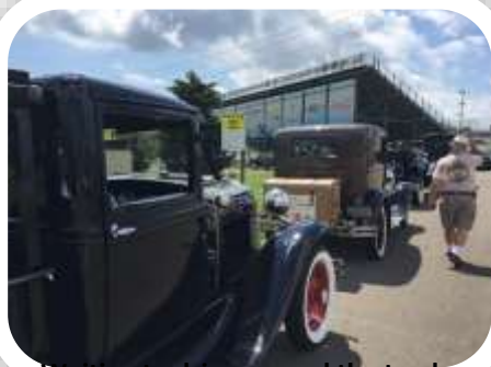
Waiting to drive around the track

We were on our way again, arriving at the Watkins Glen State Park just in time to have a short coffee break and leave for the Watkins Glen Race Track. All the cars that wanted to drive the track had to be there by 11:30 am. All the vintage automobiles lined