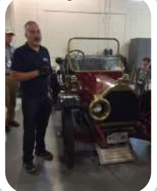
Penn College Instructor