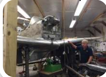
P-40 Restoration Project

The Glenn Curtiss Museum is a gem and we can definitely say it is something you would not want to miss if you are in this area. There is something for everyone at this museum, for the avid car collector, aviator, motorcycle enthusiast or just interested in everyday memorabilia from the past. The museum volunteers currently are restoring a P-40 plane and we were able to see how they are accomplishing this restoration.