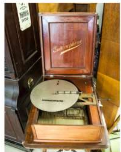
One of the music boxes on display