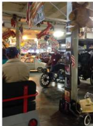
Tram tour ride through the thousands of antiques