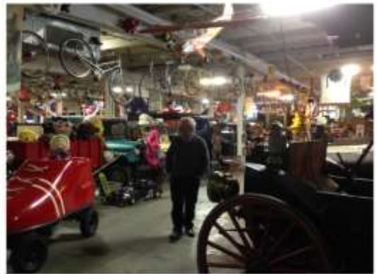
Numerous antique autos to see on the tram tour with many eclectic items of years gone by.

It was a wonderful day and it was so good to see many of our friends from the two North Jersey regions.