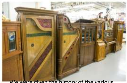
We were given the history of the various Nickelodeons, many of which were played for us.