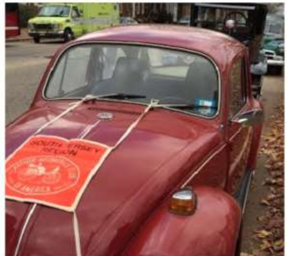
Edna Norris 1970 Volkswagen