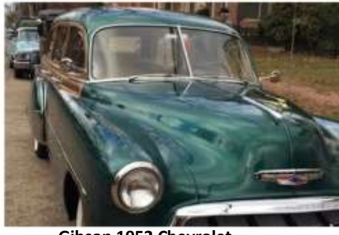
Gibson 1952 Chevrolet