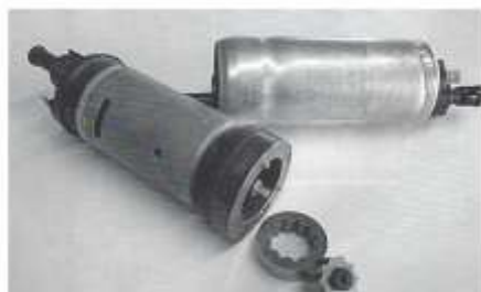
This is my electric fuel pump taken apart so you can see the two stainless steel gears inside.

You always want to use a 30-micron fuel filter with your electric fuel pump.