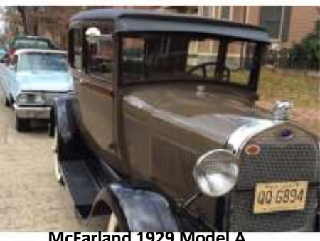
McFarland 1929 Model A