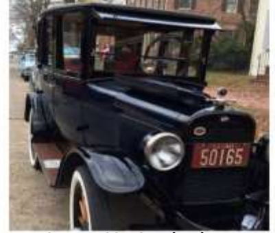
Green 1924 Overland