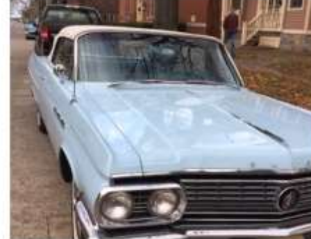
McFarland 1963 Buick