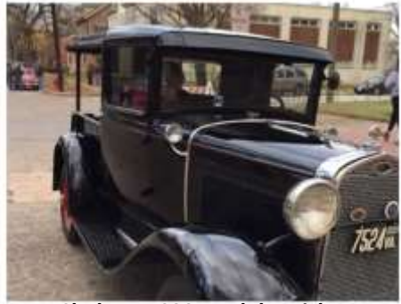
Shelton 1930 Model A Pickup