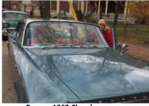
Faunce 1963 Chrysler