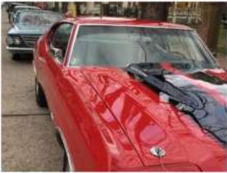
Birchmire 1970 Chevelle