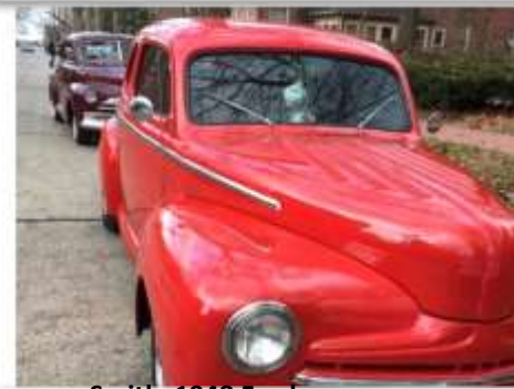
Smith 1948 Ford