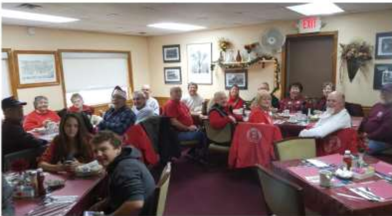
Enjoying breakfast before the parade at the Salem Oak Diner

We couldn't have asked for nicer weather.