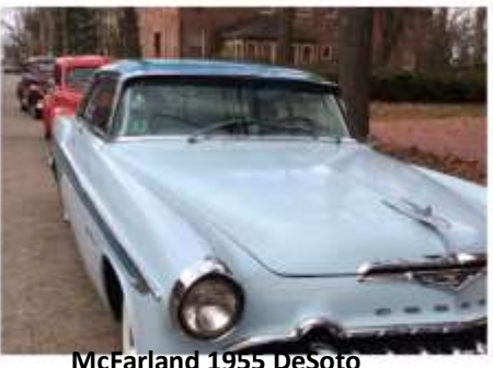
McFarland 1955 DeSoto