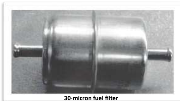
30-micron fuel filter

DISCLAIMER: The V-8 Club does no independent testing of any of the products, designs, opinion, thoughts or suggestions presented in the V-8 TIMES.