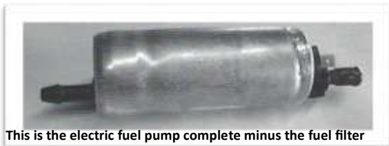
This is the electric fuel pump complete minus the fuel filter

(Reprinted with permission from V8 Times Magazine) (July/August 2016)