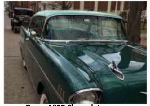
Green 1957 Chevrolet