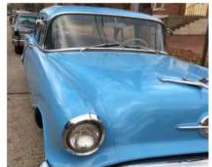
Kinsey 1956 Oldsmobile