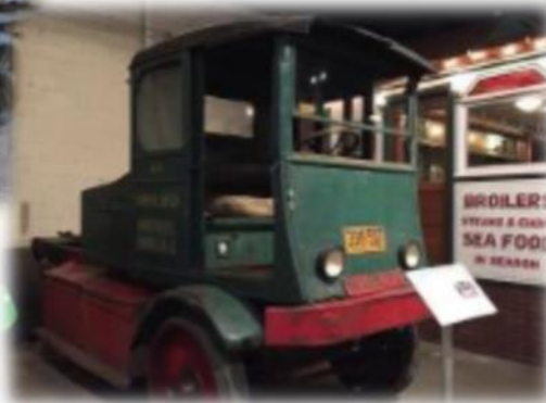
On the right is a 1924 Walker electric truck used for pulling railroad cars.