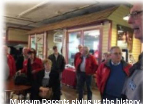
Museum Docents giving us the history.