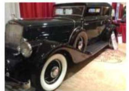
1934 Pierce Arrow