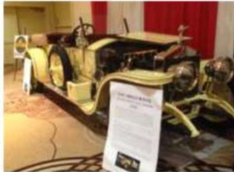
1913 Rolls Royce