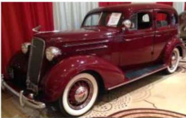
1936 Chevy Deluxe