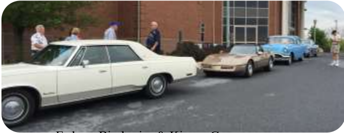
Erdner, Birchmire & Kinsey Cars