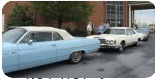
McFarland & Erdner Cars