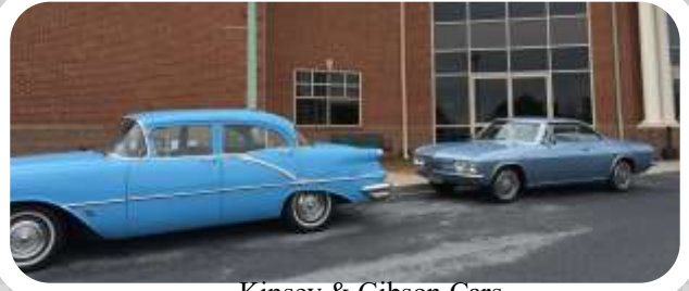
Kinsey & Gibson Cars