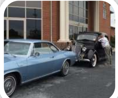
Gibson & Shelton Cars