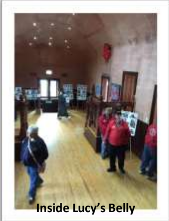
Inside Lucy's Belly

We had a wonderful time visiting Lucy and all who purchased tickets received a free ticket for a future visit. This was because we were unable to climb up into Lucy's howdah on her back because of the rain. It was definitely a very educational visit.