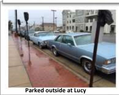
Parked outside at Lucy

We had a wonderful time visiting Lucy and all who purchased tickets received a free ticket for a future visit. This was because we were unable to climb up into Lucy's howdah on her back because of the rain. It was definitely a very educational visit.