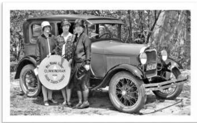
The Hat Women of 1928 above.