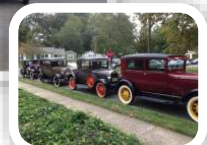
Some of the cars brought for the funeral parade.