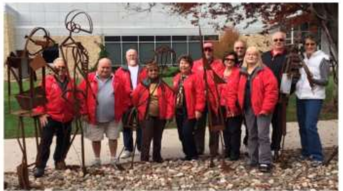
Our group is standing with sculptures made by the students outside the Automotive Technology Building.

The Penn Tech campus is state of the art and we were very impressed.