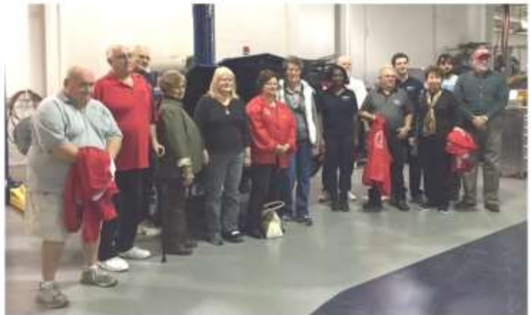
Our group with our student guides. We presented a $500 check to the school.

After we completed touring the Automotive area we went to the school's beautiful restaurant LeJeune Chef where we were served a wonderful lunch. Penn Tech also offers many other course opportunities for students, i.e. Culinary Arts, Hospitality, Nursing, and many more.