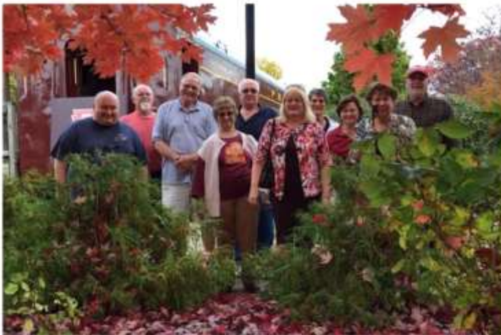
Outside the Herdic Museum in front of the 1949 Pullman Car

Our first stop was to visit 2 local museums, the Peter Herdic Transportation Museum and also the Thomas Taber Museum. Both museums were packed with local history of the area.