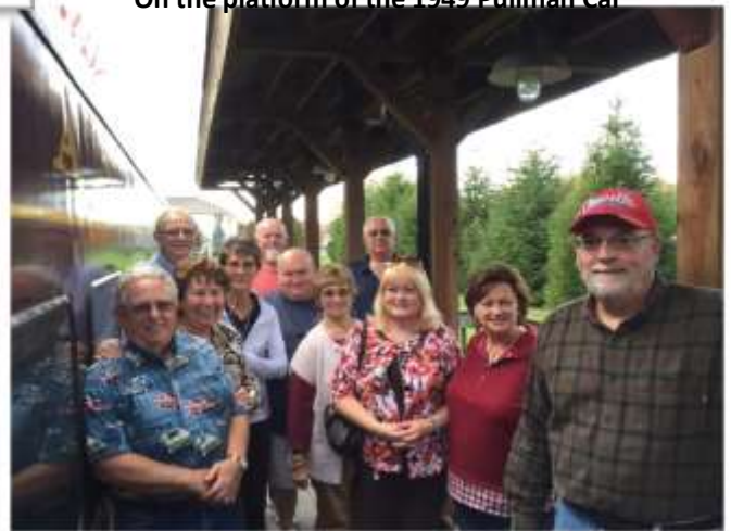
On the platform of the 1949 Pullman Car

We traveled up avoiding major interstate roads and passing beautiful country side and towns. We especially enjoyed the fall foliage and breathtaking vibrant colors of the season. We dealt with a little rain on the way up but it passed quickly and we arrived in Williamsport around 2:00 pm after stopping for lunch.