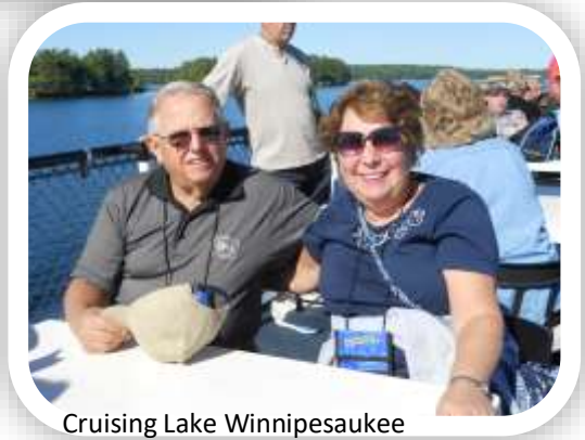
Cruising Lake Winnepesaukee

On Tuesday we traveled to Maine and a coffee stop at the Parsonsfield Seminary where the buildings once housed a private high school run by the Free Will Baptist from 1832 to 1949. It was also part of the "Underground Railroad".