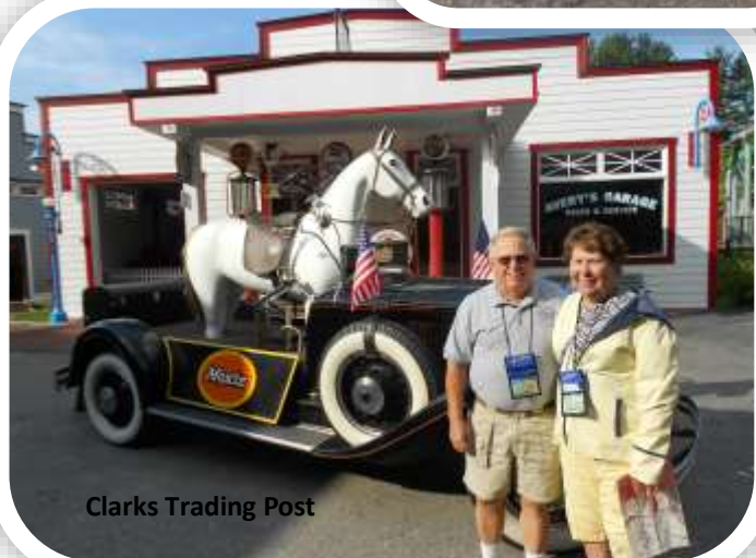
Clarks Trading Post

We definitely recommend taking an AACA tour or even a Glidden tour.