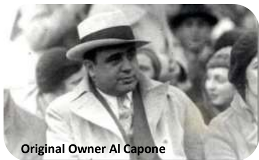
Original Owner Al Capone

To top it off, the gangster's 1928 Cadillac Town Sedan had 3,000 pounds of armor and inch-thick bulletproof windows. It also had a specially installed siren and flashing lights hidden behind the grille, along with a police scanner radio.