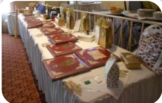
Photo albums & door prizes on display.