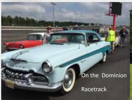
On the Dominion Racetrack