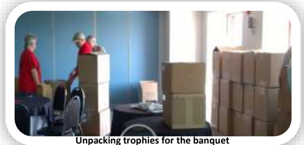
Unpacking trophies for the banquet

The judging began at 11 AM and the rain made its appearance at the same time. So the cars sparkled with raindrops (and not a one melted) and the judges in their raingear and the owners all did the normal routines of judging.