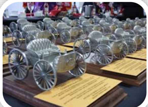
The Senior Awards