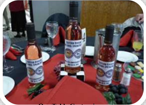
Our Table Centerpieces