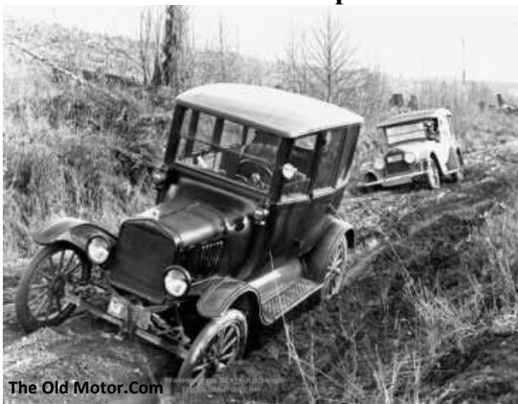
The Old Motor.Com