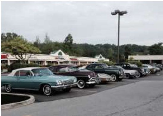
More photos on page 8.