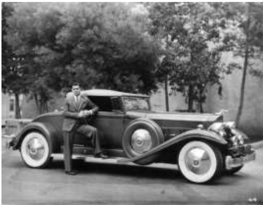
Clark Gable with his 1932 Packard