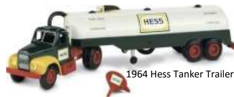
1964 Hess Tanker Trailer

Even as it was announcing the end of its retail gas station business last year, Hess was celebrating the 50th anniversary of the Toy Truck with a traveling museum. It also issued a special edition toy: a big tanker with a small version of the original Hess tanker truck inside of it, the whole rig illuminated by 92 lights, including 27 LEDs. And yes, batteries were included. It sold for $45.99 and, one year later, you might pay $250.