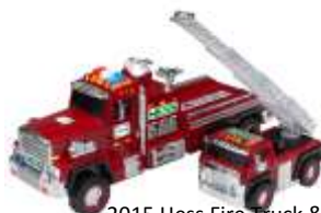
2015 Hess Fire Truck & Ladder Rescue

Thank you to Hagerty for allowing us to print their article. https://www.hagerty.com/articles-videos/Articles/2015/11/23/Hess-Toys