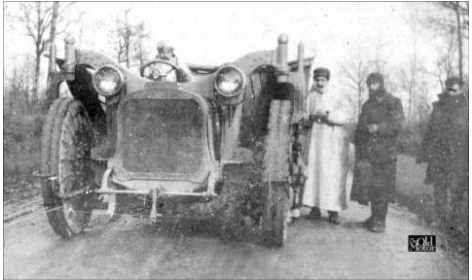
1909 Pipe equipped with Heilmann's Compound Spring Suspension on a journey to Paris, France.