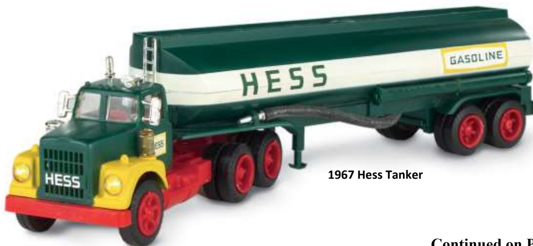
1967 Hess Tanker