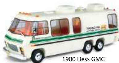
1980 Hess GMC

Great Depression. One million were sold, and mint condition examples are worth about $150. Among the fire trucks, tankers and box trailers that followed, Hess snuck in a surprise for 1988 – a racecar transporter with a separate racecar, for two toys in one. This was a harbinger of things to