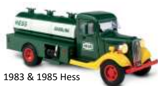
1983 & 1985 Hess '31 Chevy Tanker

The same truck returned for 1968-1969 minus the velvet-trimmed display stand, and with minor cosmetic details distinguishing each year.