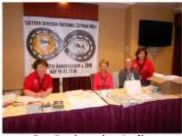
Our Registration Ladies