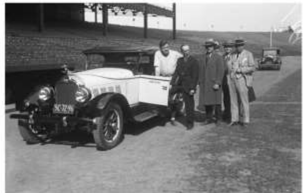
Babe Ruth receiving a 1926 Auburn Roadster as a gift

Always check out our Website SJRAACA.COM For up to date information on all our activities.