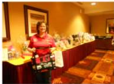
Our Hospitality Room Raffle Baskets