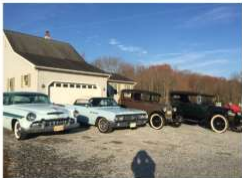
McFarland autos, waiting for their drivers before parade