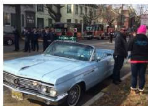
McFarland's '63 Buick