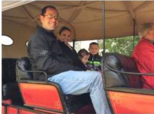
Fuller Family in 1915 Mountain Wagon