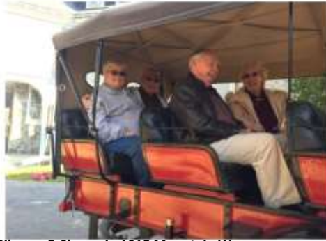
Gibsons & Shores in 1915 Mountain Wagon