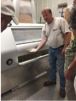
Snavely Flour Mill owner showing us the process they use to grind wheat.