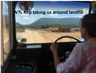
WTL Rep taking us around landfill

We traveled a few miles away to the Wayne Township Landfill and they gave us a presentation regarding their facility.