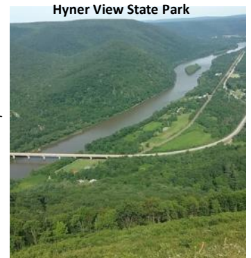
Hyner View State Park

That evening we had a lovely dinner at the Hotel Crittenden with an ice cream stop a block away at the Sugar & Cream Shop with Penn State Creamery Ice Cream. Delicious!