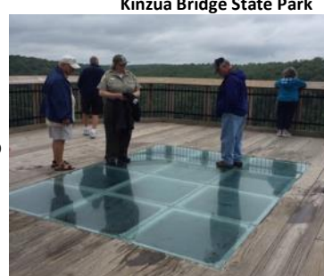
Kinzua Bridge State Park

After our Kinzua Bridge experience we traveled to St.