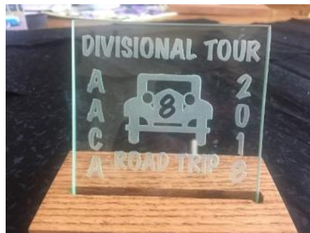
Everyone received one with their car number