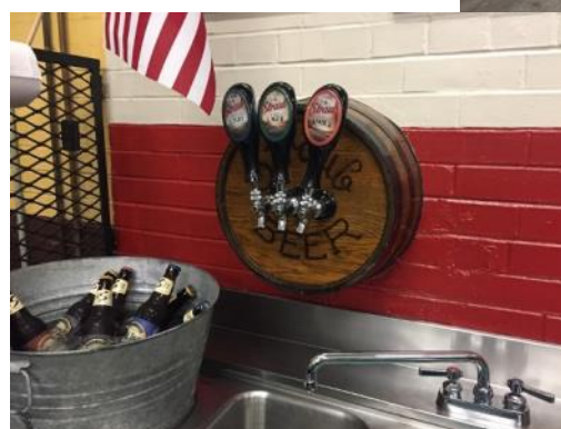
Straub Brewery "Eternal Tap"

Mary's PA and the Cobblestone Inn, our lodging for the night. We checked in at the hotel and went on to Ricks Dough Boys Restaurant for our lunch. This restaurant had 2 antique cars in it. Lunch was followed with the Straub Brewery tour and it's "Eternal Tap". Those who toured were able to enjoy a complimentary cup of Straub beer.