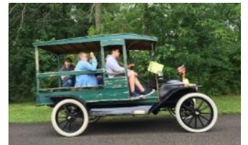
Shelton 1914 Ford Model T.

The automobiles that did show up were beautiful. Despite the dreary weather we had a wonderful day.