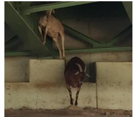
Two of the resident goats