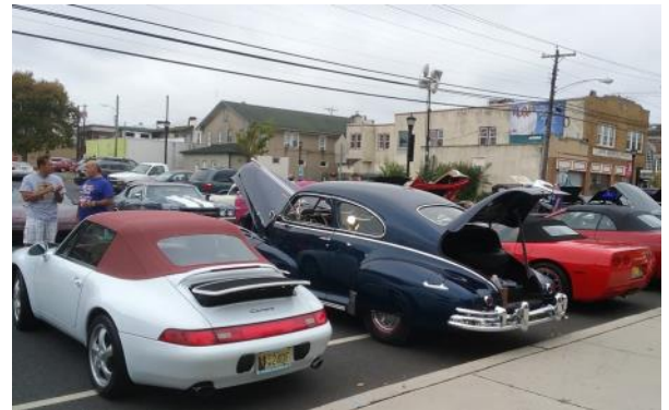
My 1948 Pontiac Streamliner surrounded by a bunch of "younger" cars at a recent show.