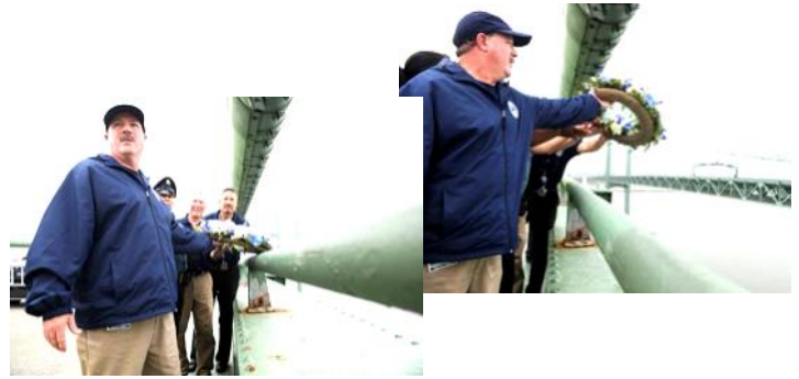
DRBA Employees participating in the Wreath Ceremony

The group of cars then stopped atop of the second span and several of the Bridge Authority employees got out and participated in a wreath ceremony to remember and honor construction workers who died building the span and employees who passed away in the line of duty since 1968.