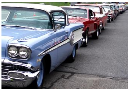
Lined up ready for parade and wreath ceremony

Once we arrived at the area, the cars were all