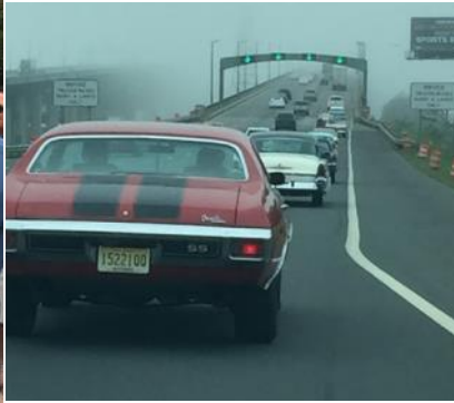
21 classic cars being Escorted over bridge in fog

The Bridge Authority sent two police vehicles to escort the 21 cars over the bridge to the "Vincent A Julia Building" where a special ceremony was held to commemorate the occasion.