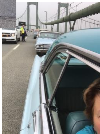
The cars sitting atop the Bridge second span waiting for wreath ceremony

After the ceremony was completed we all went back to our cars and readied to travel (escorted again) over the bridges.