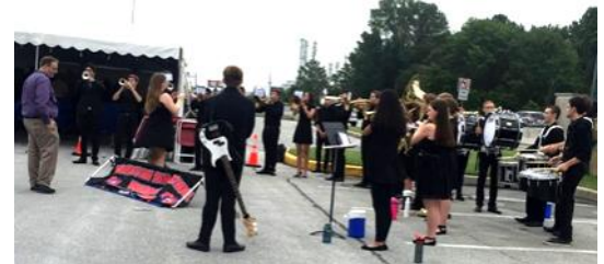
Woodstown NJ High School Marching Band provided music

More photos can be seen on our club website, www.sjraaca.com .