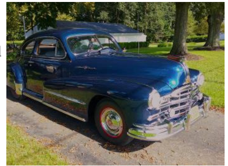
Bill's '48 Pontiac Streamliner

At first I thought he was pulling my leg. But as I explained they were cranks to wind the windows up and down I realized it was quite possible he had never seen one. I then opened the door and demonstrated