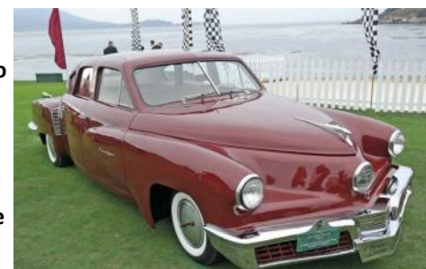
1947 Tucker "Tin Goose" prototype number 1000 from the William E. Swigart Jr Automotive Museum Huntington, Pennsylvania

They have an entire wing dedicated to the Tucker Automobile that you would really enjoy.