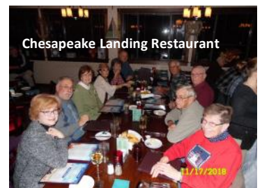
Chesapeake Landing Restaurant