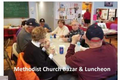
Methodist Church Bazar & Luncheon

Then we traveled back to St. Michaels and shopped at