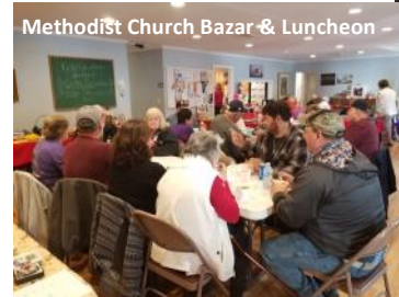
Methodist Church Bazar & Luncheon

the many shops in town. That evening we had dinner at the Chesapeake Landing Restaurant.