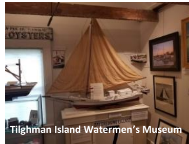
Tilghman Island Watermen's Museum

local Methodist church was having a church bazaar and chicken salad and soup sale. We all decided to go there for lunch. We enjoyed homemade soup and chicken salad sandwiches. And many