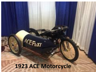
1923 ACE Motorcycle