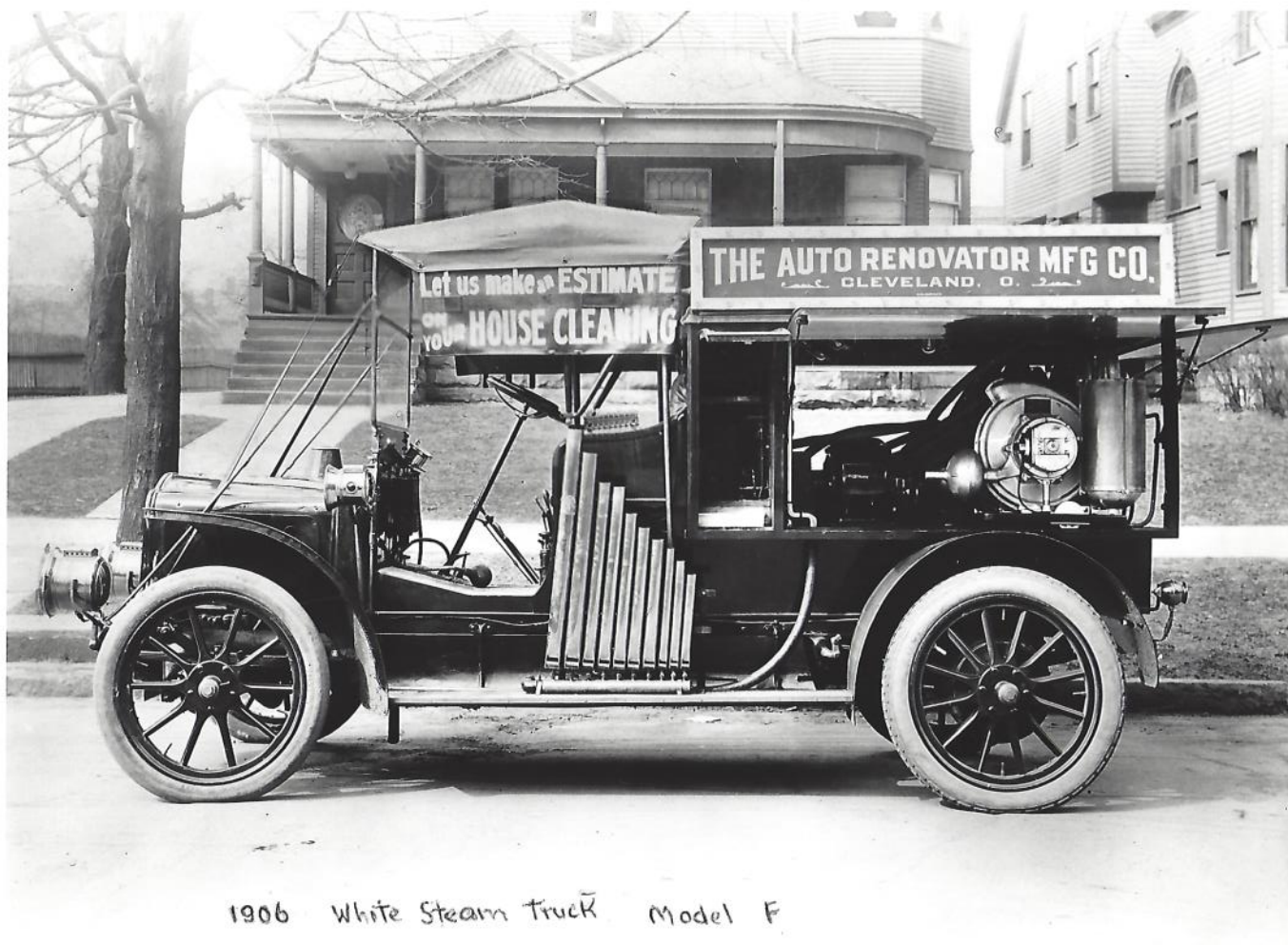
1906 White Steam Truck Model F

What about the steam calliope on the running board. I am sure this truck attracted a lot of attention.