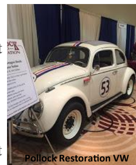
Pollock Restoration VW