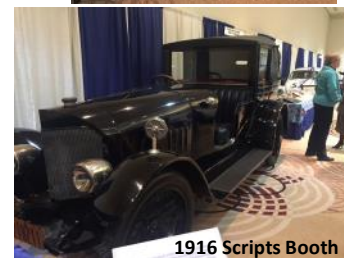
1916 Scripts Booth