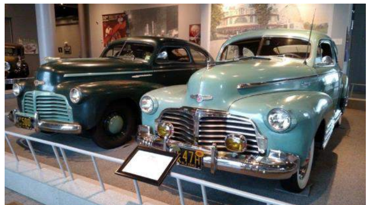
Pictured above are both of Chuck's 1942 Chevrolets on display at the America On Wheels Museum in Allentown, PA.

Our car was built in December of 1941 at the Los Angeles, CA plant. Chevrolets built after the beginning of January were full "blackout" cars bearing no bright work at all except the bumpers. Our car, however, has some "blackout" trim inside with dark green plastic door handles and window cranks. (We also own a 1942 Chevrolet Blackout which will be the subject of a future article.) Based on a lube sticker found on the driver's door, we believe that the '42 spent most of its working life in the Sacramento, CA area. Apparently, the car was involved in a fender-bender at some point as the right front fender has been replaced with a 1946 fender and there was some paint work on the right rear fender.