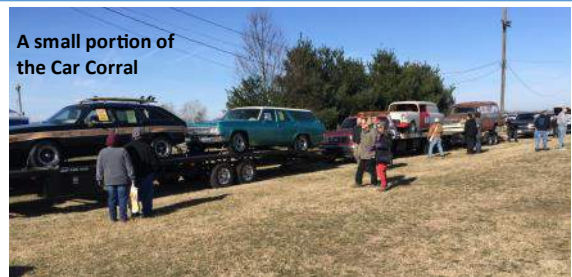
A small portion of the Car Corral