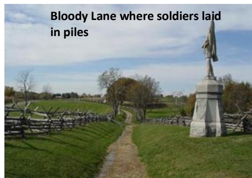
Bloody Lane where soldiers laid in piles