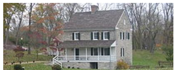
Below the Hager House