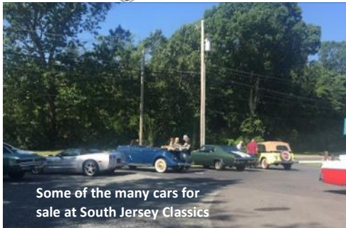
Some of the many cars for sale at South Jersey Classics