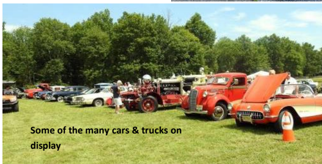
Some of the many cars & trucks on display