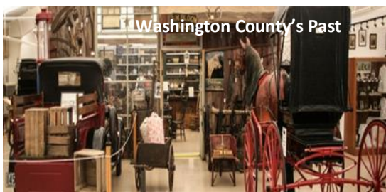
Washington County's Past