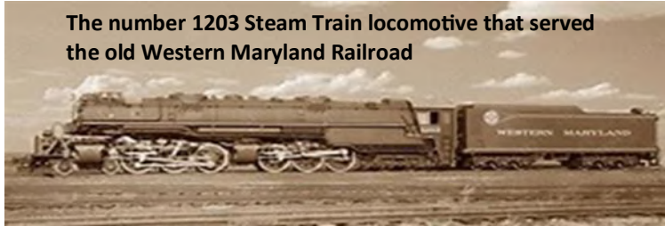
The number 1203 Steam Train locomotive that served the old Western Maryland Railroad