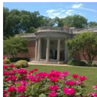
Left photo—The Art Museum

We even picnicked there next to railroad engines that once served the region on their route from Washington and Baltimore through Hagerstown which was known as the "HUB CITY" to all points west. Consensus of the group was that to grow up and have that museum and the park there was very nice for us.