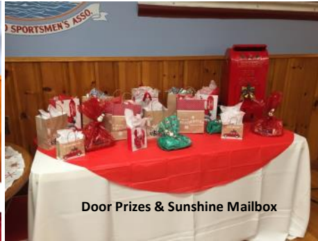
Door Prizes & Sunshine Mailbox