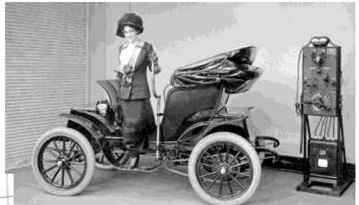
A woman with a runabout (above) with GE charger made for use in the home garage.

The image at top of article, contains a Cuyahoga EV, and a GE mercury arc rectifier battery charger. It was produced by the Cuyahoga Motorcar Company in Pennsylvania from 1908 to '09, and 1910 to '11 by the Cleveland Electric Vehicle Company.