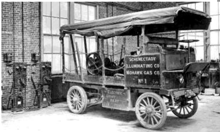
Photo on left—1914: Schenectady Illuminating truck and a GE mercury arc rectifier battery charger.