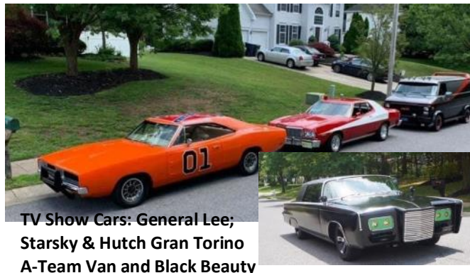
TV Show Cars: General Lee; Starsky & Hutch Gran Torino A-Team Van and Black Beauty