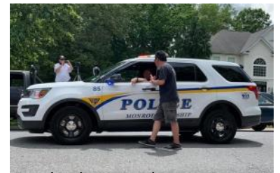
Thank you to the Monroe Twp. Police who led the parade