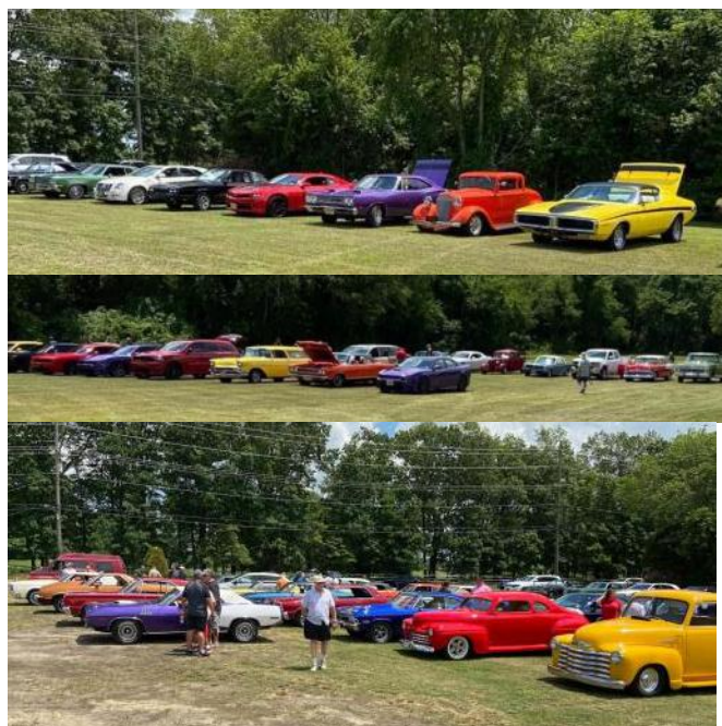
The many cars in the staging area at Carmens.

At 1:45 pm, Tyler was kept distracted at the back of their home while all the birthday signs were changed to Graduation and Congratulation signs.