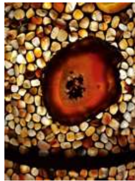
Light fixtures in one of the casinos