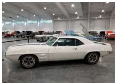
Pontiac Trans Am #1