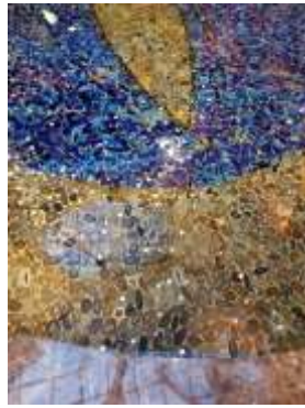
Beautiful floor mosaic detail