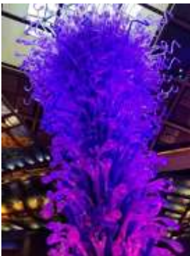
The Dale Chihuly sculpture at the center of it all