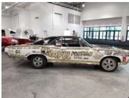
Drag Race Car 1966 GTO Knafel Pontiac Tim Indian