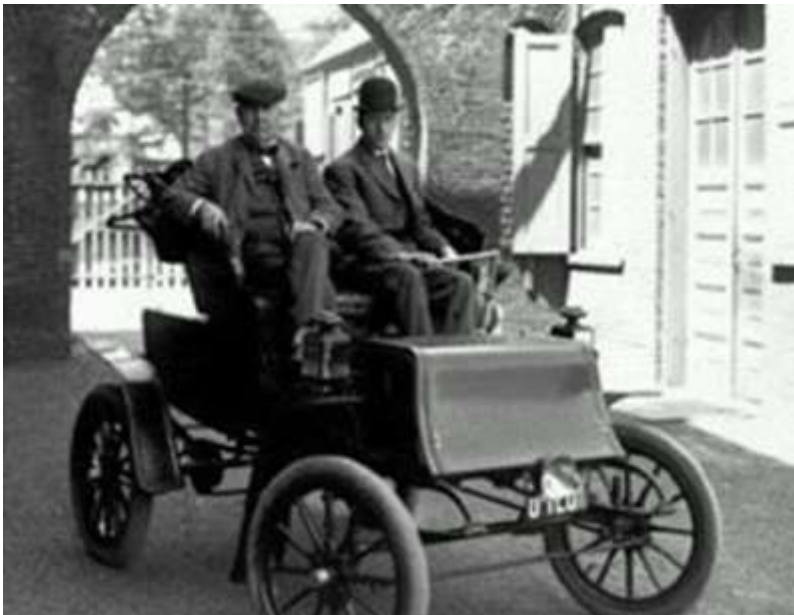
Thomas Edison on his 1903 Electric Studebaker He purchased the second electric car produced.