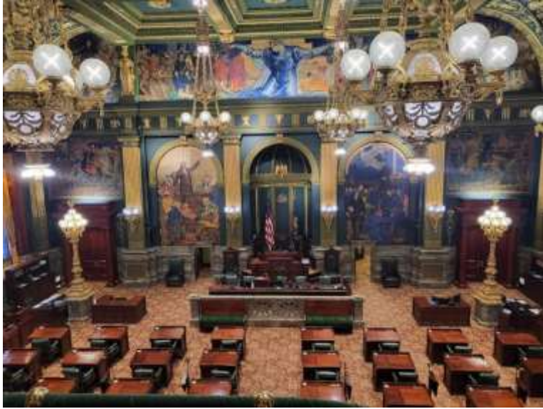
Pennsylvania State Capital