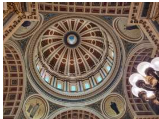
Pennsylvania State Capitol