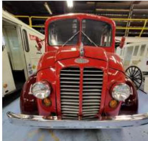
Jay Crist Collection