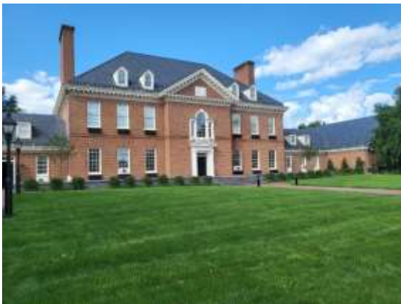
Pennsylvania Governor's Mansion

We encourage everyone to at least think about going on a tour! The schedule for 2023 is in the latest edition of Antique Automobile and there is something for everyone. Maybe you're interested in going to Canada or maybe you want something a little less ambitious and closer to home - there is a nice tour in Denver PA hosted by the AACA Library that might be just right.... 😊