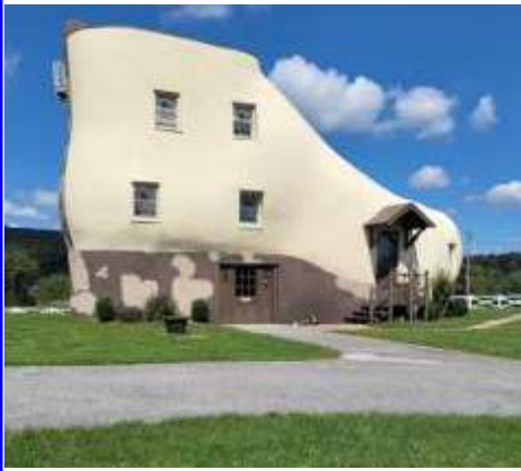
Haines Shoe House (Soon to be AirBnB)