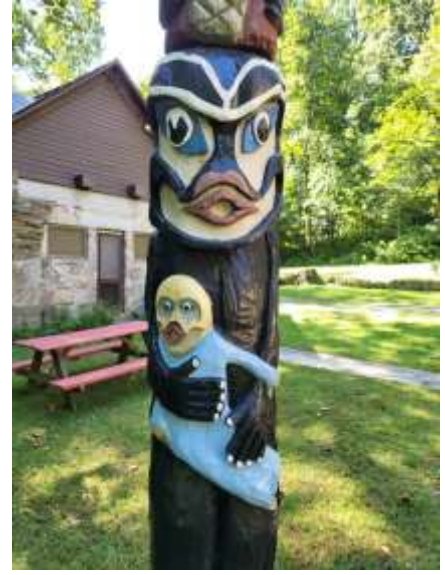
Indian Steps Museum Totem Pole