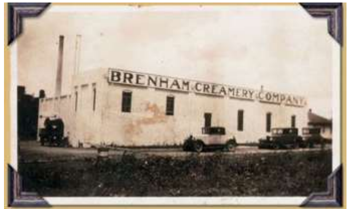
The Ford Squeaks newsletter, August 2021

Although Texans had to wait far longer for ice cream, than the rest of the country we made up for it. In 2001 Forbes named Blue Bell Ice Cream No. 1 in America.