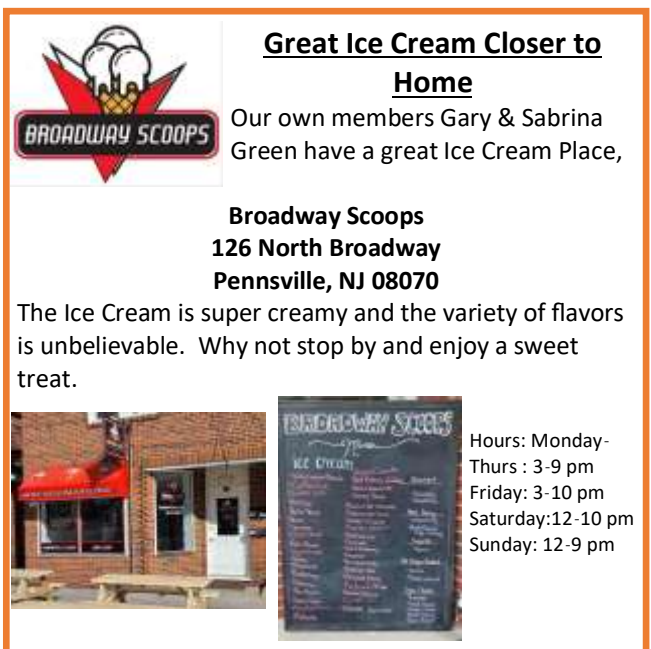
The Broken Axel Newsletter, September 2021