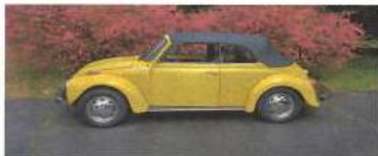
From AACA Spring 2022 Rummage Box

Fast forward 45 years. Driving through town, there beside the road was a nearly identical 1976 bright yellow super beetle convertible with a for sale sign in the window. With a little negotiation we now have our beloved bright yellow super beetle back to drive and enjoy. Now we are making new memories and look forward to seeing you on a National AACA Tour. Look for the bright yellow Super Beetle Convertible. See you down the road!