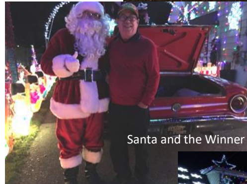
Santa and the Winner