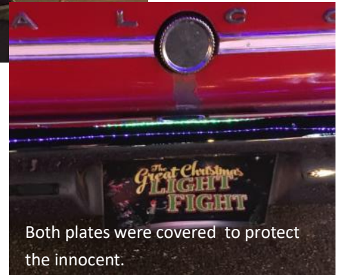
Both plates were covered to protect the innocent.