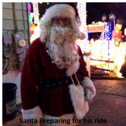
Santa Preparing for his ride

One little boy came up to the window and tapped on it. I rolled the window down and he asked, "Santa, am I on the good list or the naughty list?" I hesitated for a moment and said, "I am reviewing the list and yes, your name is on the good list." He immediately smiled and turned to his parents saying "mom, dad I am on the good list." I then put my hand out the window and gave him a high five. His father gave me a thumbs up and a smile. His son was on cloud nine and actually so was I.