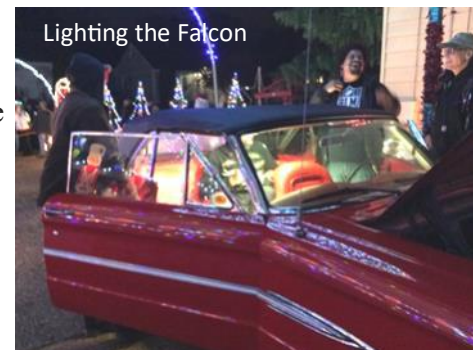
Lighting the Falcon