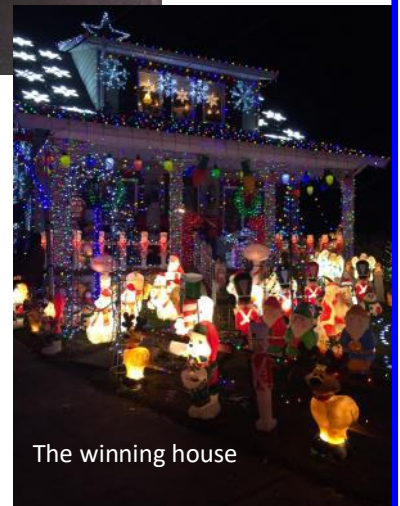
The winning house