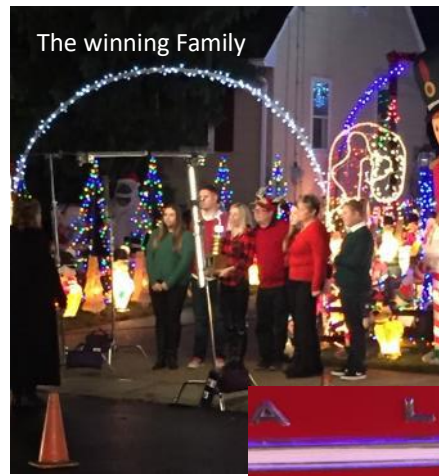
The winning Family

I jokingly told my friends and family it was my, less than two minutes, of national fame. (Most people didn't even know it was me) Ha ha!