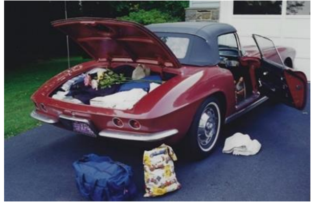
Yes, it can all fit into an 8 week trip with a little planning

Sunday of that weekend we left for Dallas and on to New Mexico and Nevada with part of the way driving any part of Route 66 in the area that was drivable. While in Montgomery we learned our daughter was in the hospital in Dallas so that Corvette really burned up the road and we made a two week stop to provide some TLC and help. We did go to the Pate Meet at the beautiful Texas Motor Speedway where we walked for 7 hours and still did not cover all of the rows. Prices seemed higher than in the east and there was less bartering. We visited the Buick tent and those Buick folks remembered our cross-country trip with our 1936 Buick a few years prior so no one was amazed that we were doing this trip in a 62 Corvette. We enjoyed the speedway- it was