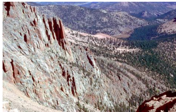
Photo op. looking over the edge of the road.