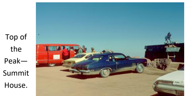
Top of the Peak—Summit House.