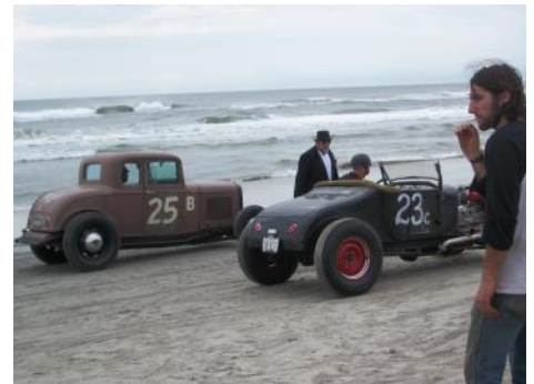
Some photos from The Race of Gentlemen website.