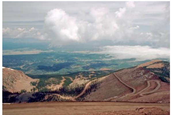
A view at the roadway below. 19 1/2 miles with 162 turns.

Test cars at a typical scenic tourist stop.