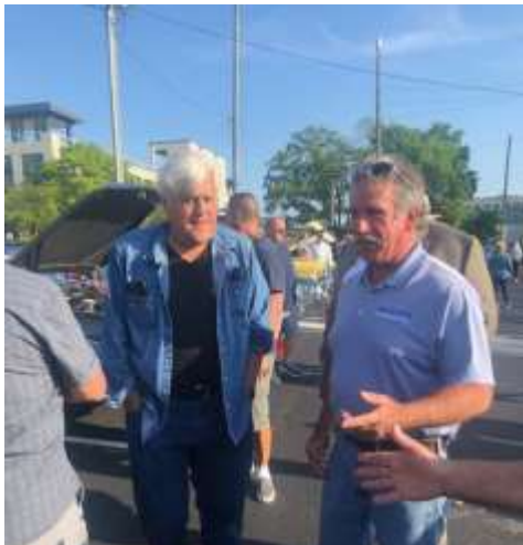
From AACA Spring 2022 Rummage Box

Looking back over the past 27 years, the AACA has been as much of a great adventure for me as it is a great car club!