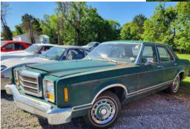
If you want a Granada – visit Smoky Mountain Auto Traders!

The next segment of our tour took us along 17 miles of the Foothills Parkway, with its curvy roads, differing elevations and gorgeous vistas.