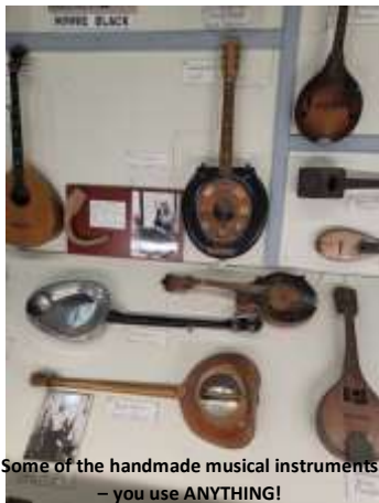
Some of the handmade musical instruments – you use ANYTHING!