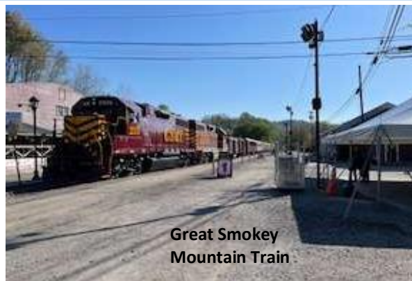
Great Smokey Mountain Train

The next day was spent doing a little touring of the area and spending a good part in Uncle Bill's Flea Market. It was like going through a super mall. Building after building all attached.