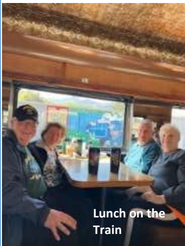
Lunch on the Train