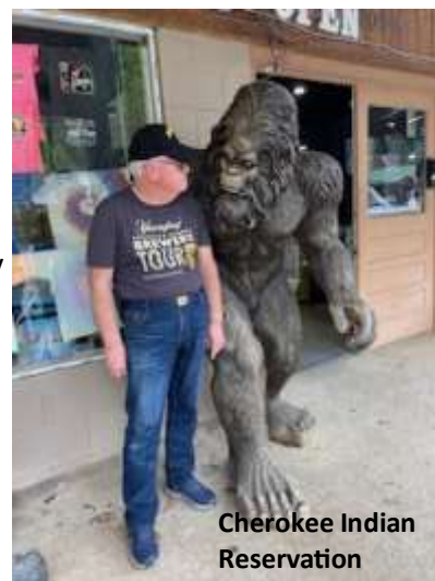
Cherokee Indian Reservation

Saturday was a little disappointing. The decision was made to venture to the city of Cherokee and the Indian Reservation. Found out the Indians must really be from China. Everything we looked at in the Cherokee stores was made in China sold by another group from another country.