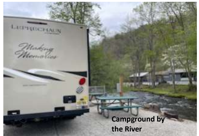
Campground by the River

Thursday was to be our big day. After rising early and having a light breakfast we all headed to downtown Bryson City.