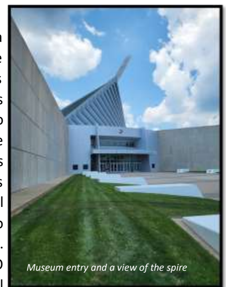
Museum entry and a view of the spire

Thursday June 13 , a short trip up Route 1 got us to the Museum of the Marine Corps. We've seen the "wing" of this building sticking up as we drove past on 95 so it was nice to stop and see what it was all about. The design of the building is based on the angles seen when viewing photos of the flag raisers of Iwo Jima. The museum has exhibits broken down by era. You walk through the artifacts and along the way there are interactive displays and docents standing by to answer questions. The first floor is laid out in a circle, so it is easy to move from era to era. On the second floor there is a wonderful gallery with a temporary exhibit called "Go to War...Do Art", devoted to Marine Corps combat art created by 29 combat artists. Excellent display. Other highlights for me were the Iwo Jima Flag display, a giant LEGO sculpture, and 9/11 artifacts from the Pentagon and WTC. They are still working on the most current exhibit covering 1976 through the wars in Iraq and Afghanistan. The exhibit is closed while they complete it, but you can get a birds eye view of the display from the 2 nd floor gallery.