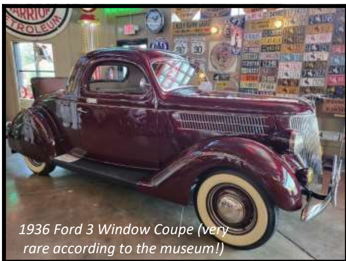
1936 Ford 3 Window Coupe (very rare according to the museum!)

The bus took us on a guided tour of the Eagle Butte Coal Mine which was fascinating. The bus was a bit hot, but the driver was cheerful and full of interesting information about the coal mining industry in the area. We heard about the steps taken to prepare these sites for mining and reclamation after mining is completed. We had passed through a field of reclaimed land without even knowing it had