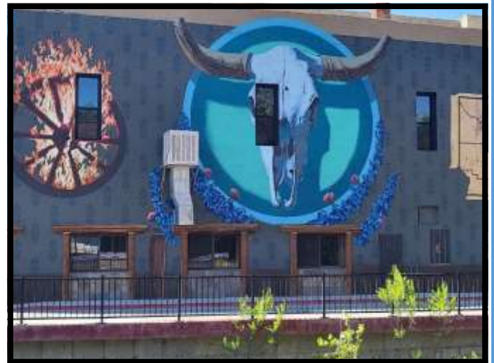
Murals on Main Street