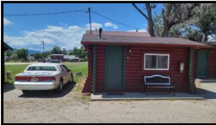
A "cozy" cabin!

the official registration day. We did some sightseeing in the town of Buffalo and waited for the rest of the group to arrive and check in. A dinner with several participants was organized and we enjoyed a great meal at the Bozeman Steak House.