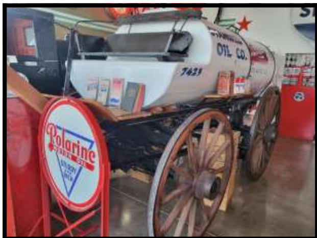
A horse drawn oil truck?

Thursday July 11th, we started the day with the driver's meeting where Juli Aubrey gave us our complicated directions to Gillette. "Leave the hotel, turn left and stay on Route 16". We were also instructed to stay hydrated and avoid altitude sickness. Our elevation was about 4,700 feet, which to some of us, was very different! The ride to Gillette was beautiful and we arrived at the Frontier Auto Museum where they had the road blocked off for us to park. The museum was full of goodies and room after room packed with treasures. A really nice collection. There was a little bit of concern when it was announced that our bus to the next stop had broken down, but someone pulled off a little miracle and the bus arrived to collect the first group just a few minutes late.