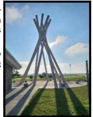
South Dakota Rest Stop Art

We took the opportunity to make a side trip to Mount Rushmore on our way from Sioux Falls to Spearfish. This was the first test of the mountain climbing abilities of the car and driver (me). We survived. The view is spectacular.