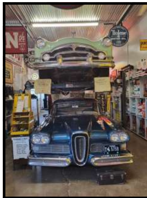
A Packard stacked on an Edsel!