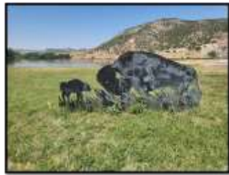
My best buffalo shot.

After we had finished exploring, we hit the road, back the way we came and stopped in the town of Worland for a visit to the Washakie Museum and Cultural Center. This place is more than just a museum. In their own words the facility “serves as a community arts and cultural center and history museum for the preservation, education, cultural enrichment, and development of the Big Horn Basin in Wyoming.” There are two permanent exhibits, the “Ancient Basin”, and the “Last West” which are both full of interesting displays