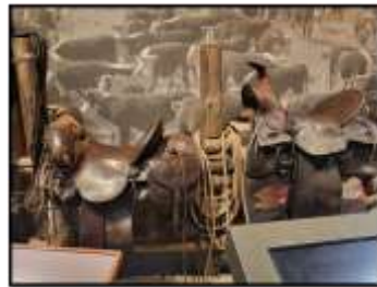
From dinosaurs to saddles at the Washakie Museum