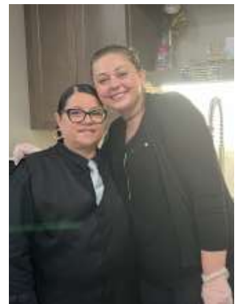
Our Servers from DiPaolo's

Everyone who attended had a wonderful time. Thank you to everyone who made our party a success.